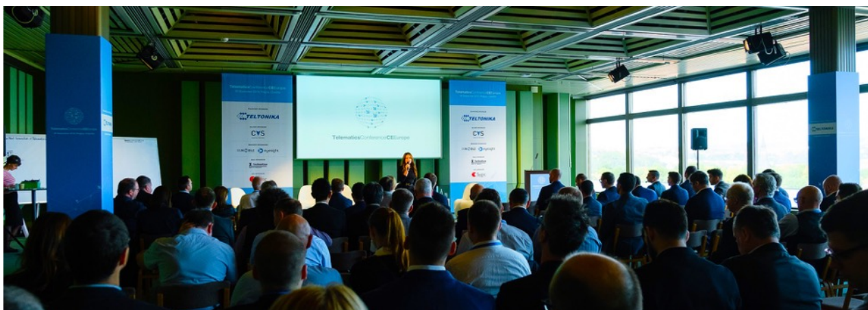
150+ delegates at 9th Telematics Conference in Prague.

On 26 September 2019, 150+ delegates took part in the 9th edition of Telematics Conference in Europe. The event was held in Prague Congress Centre, Czechia and brought together key stakeholders and decision makers from 28 countries from all around the world.