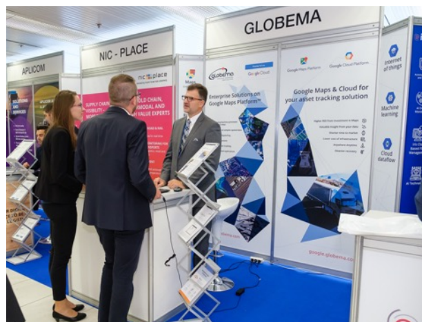
The conference was accompanied by 23 exhibition booths.